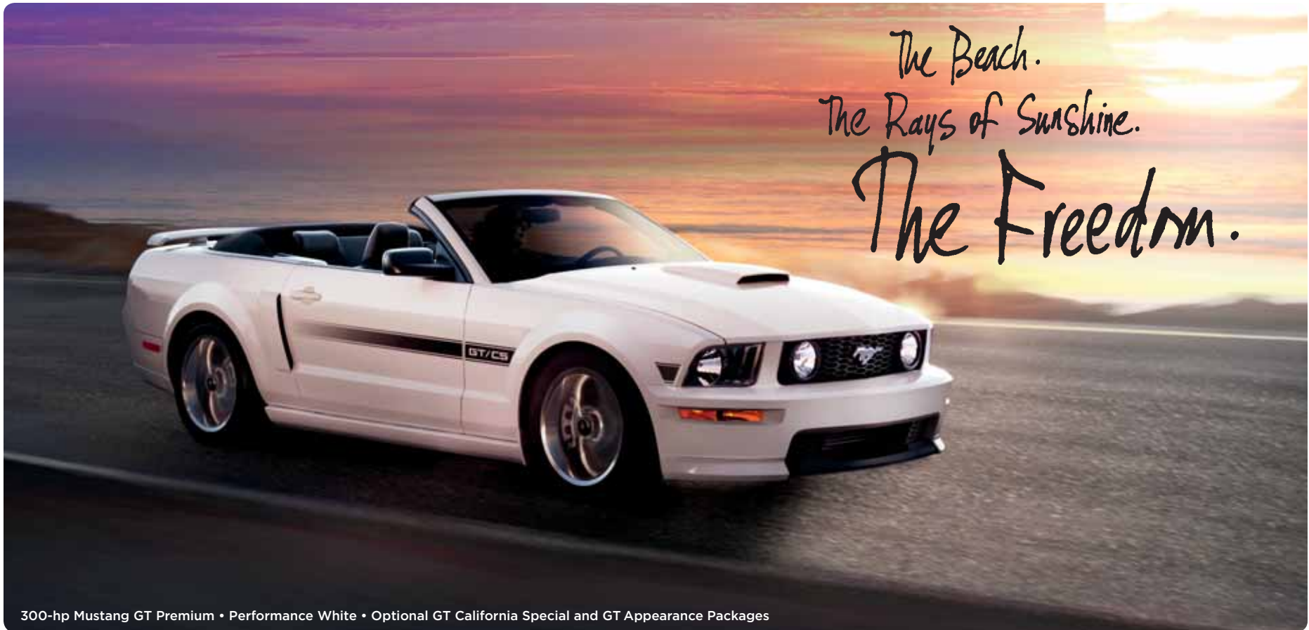
300-hp Mustang GT Premium • Performance White • Optional GT California Special and GT Appearance Packages