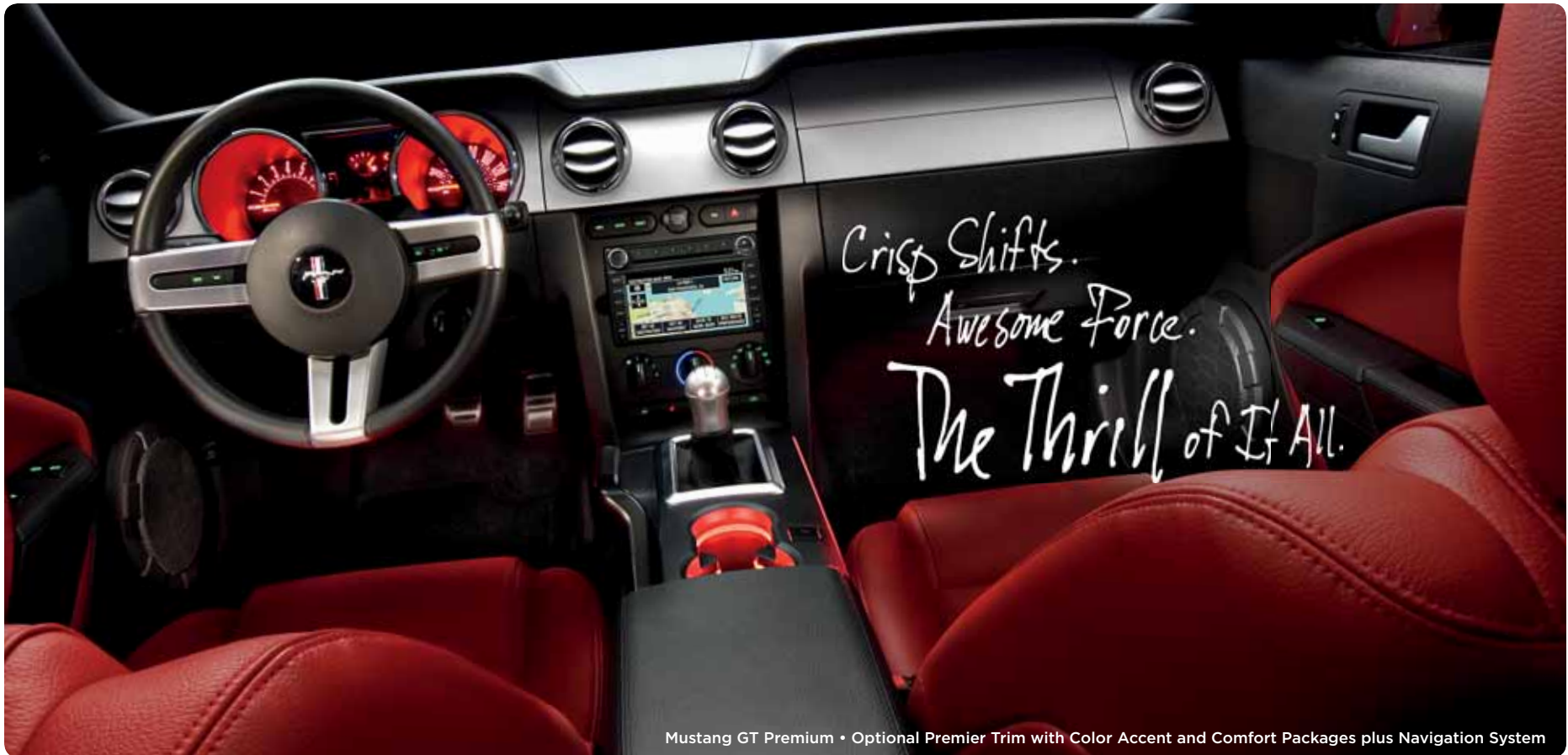
Mustang GT Premium • Optional Premier Trim with Color Accent and Comfort Packages plus Navigation System