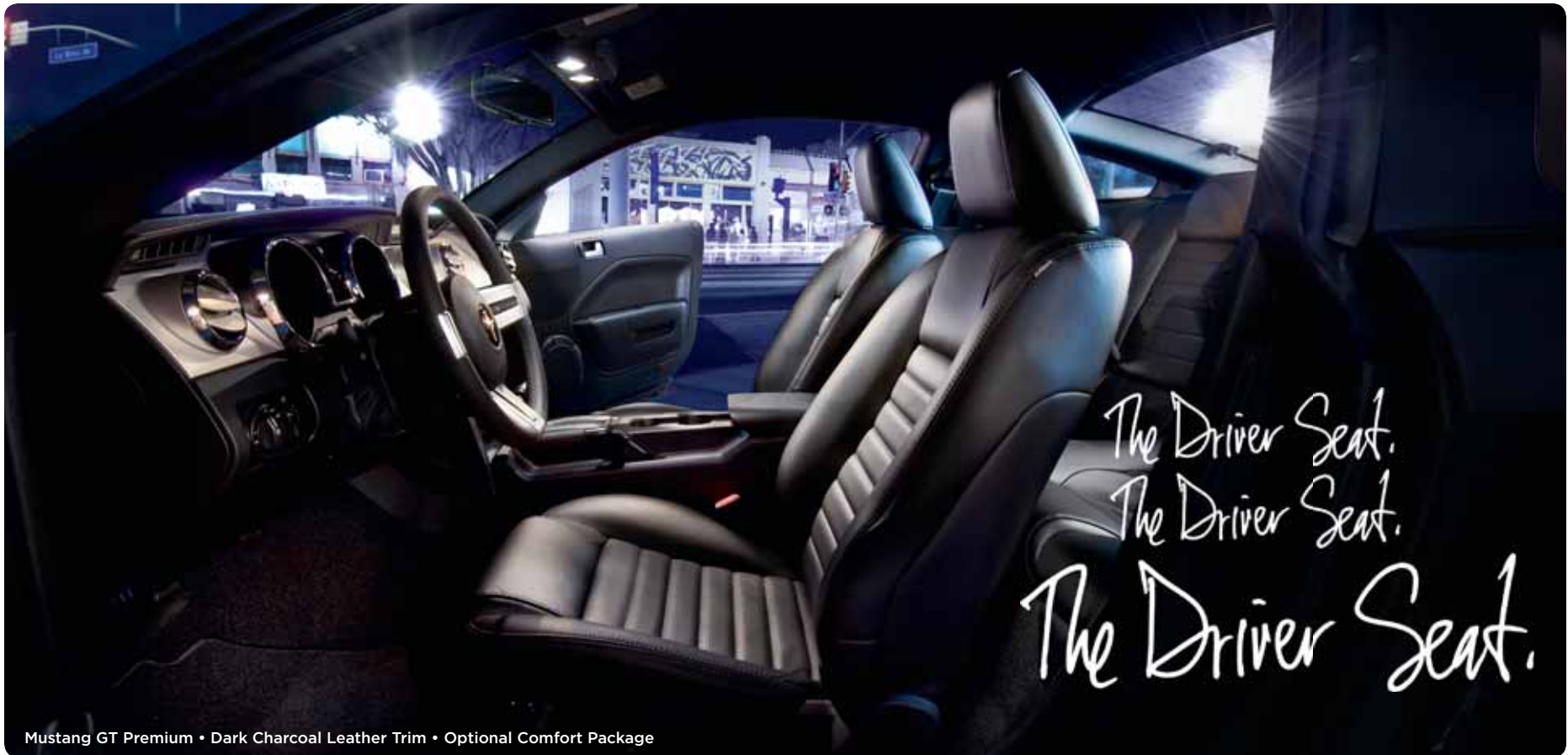
Mustang GT Premium • Dark Charcoal Leather Trim • Optional Comfort Package