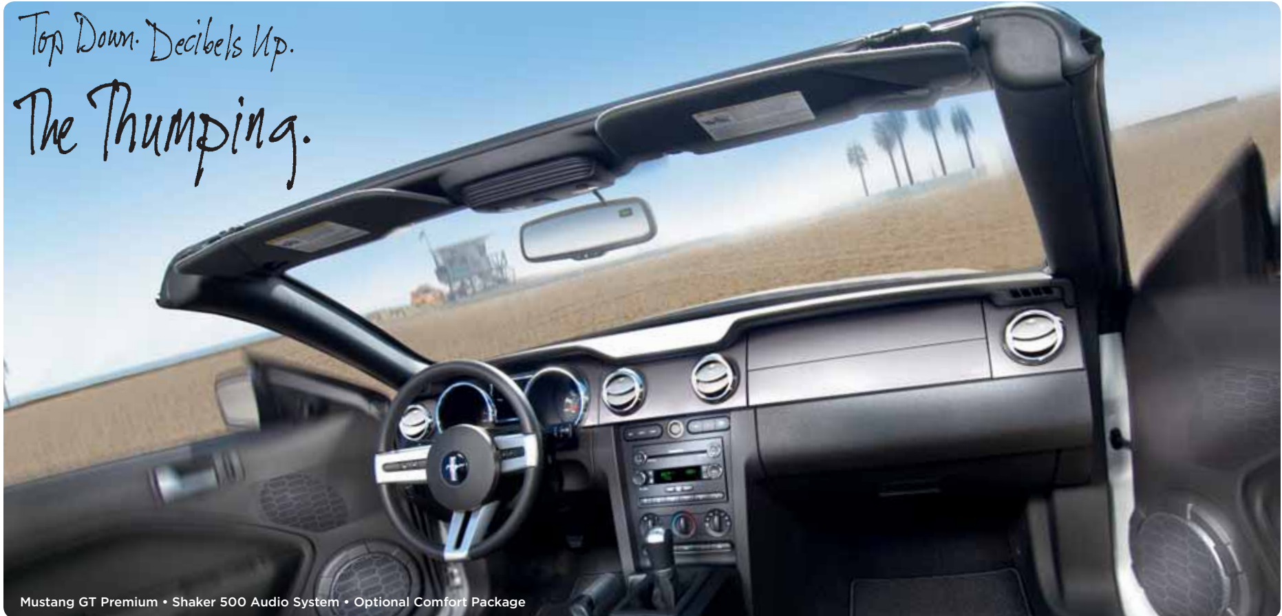
Mustang GT Premium • Shaker 500 Audio System • Optional Comfort Package