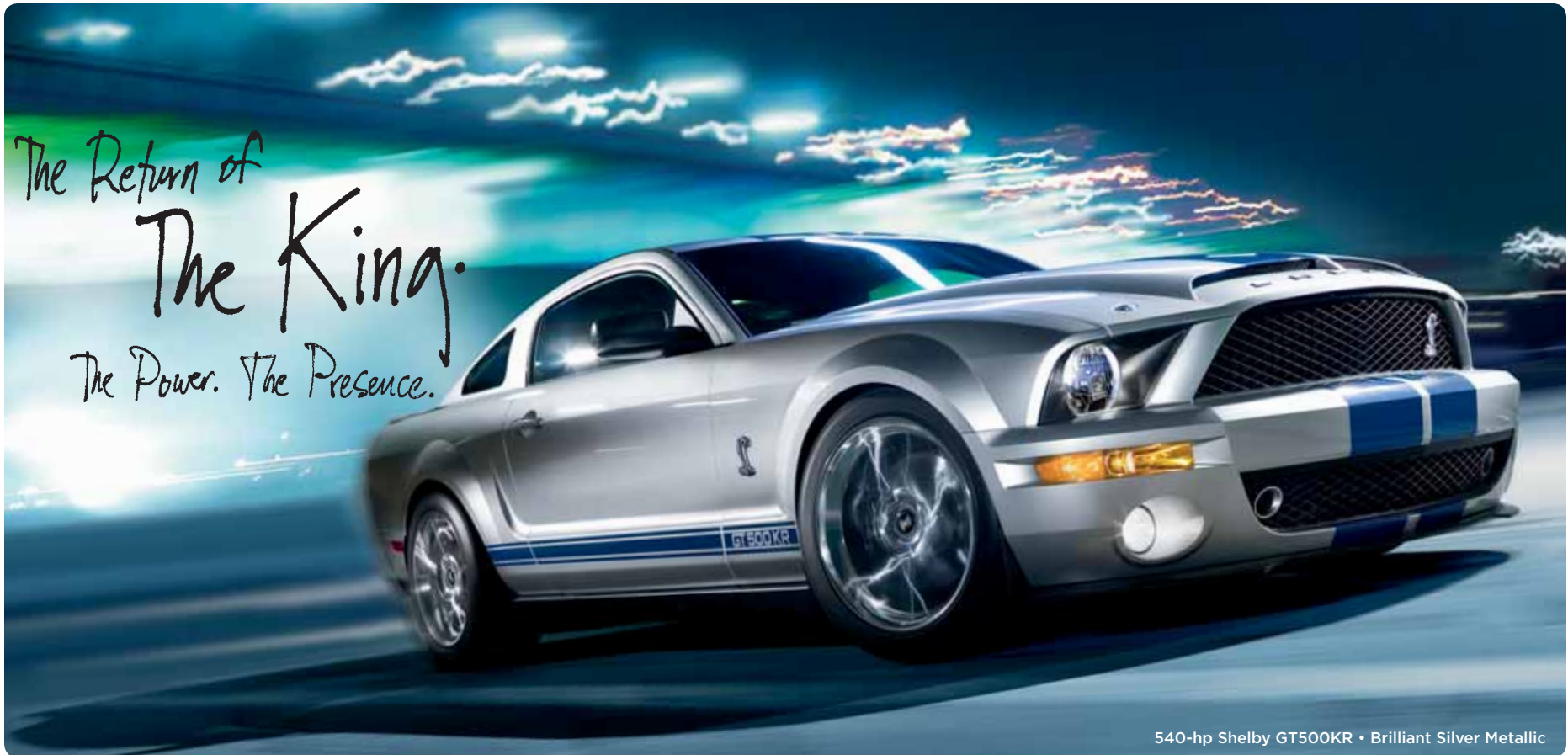
540-hp Shelby GT500KR • Brilliant Silver Metallic