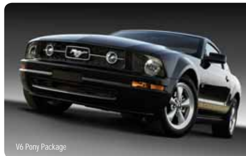
V6 Pony Package