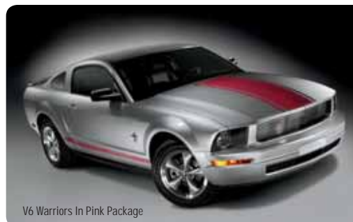
V6 Warriors In Pink Package