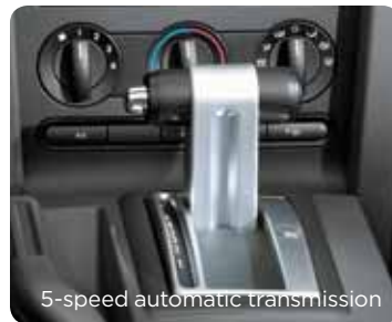
5-speed automatic transmission