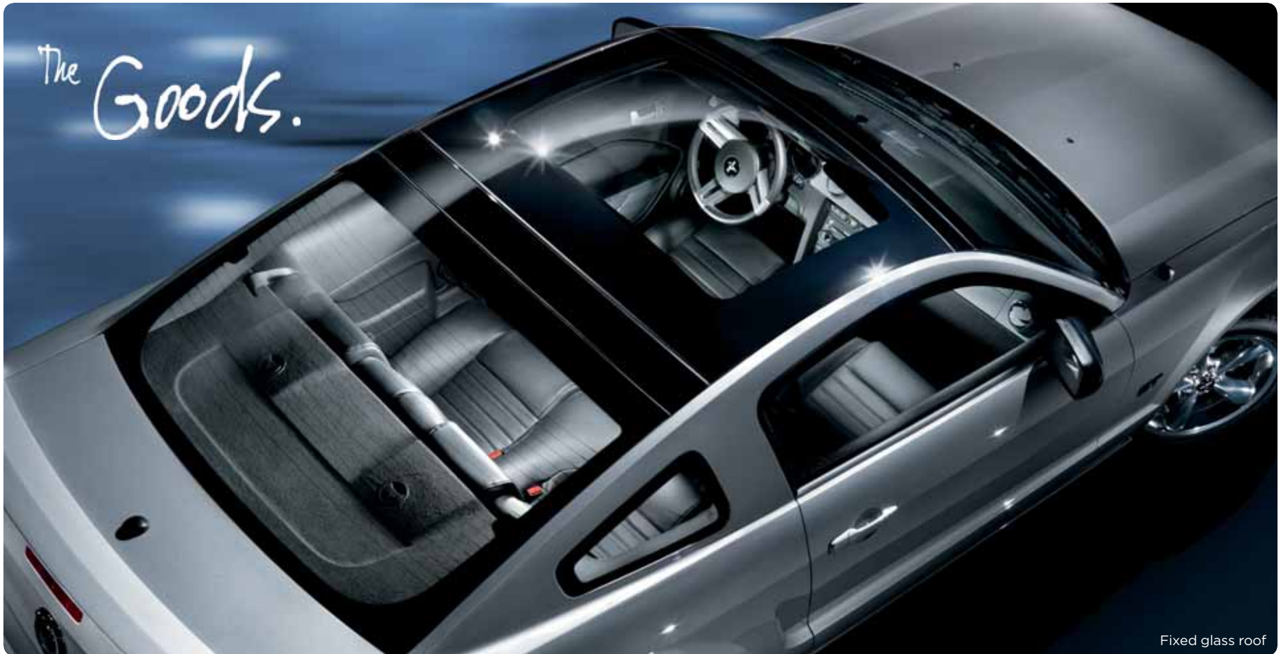
Fixed glass roof