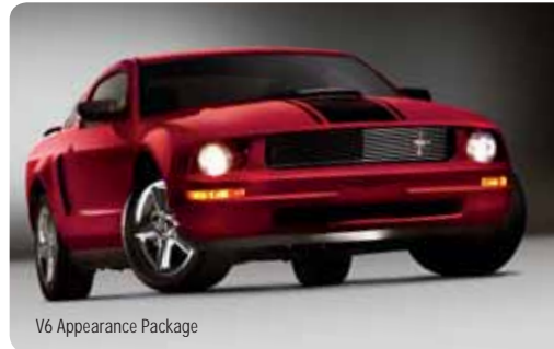
V6 Appearance Package

Premier Trim With Color Accent Package Includes wrapped and stitched instrument panel brow, console lid and upgraded door armrests; satin aluminum-plated shift lever (automatic) or bright polished shift knob (manual); aluminum pedal covers; leather-trimmed sport bucket front and rear seats; matching door-trim inserts and floor mats; and your choice of 4 interior color combinations