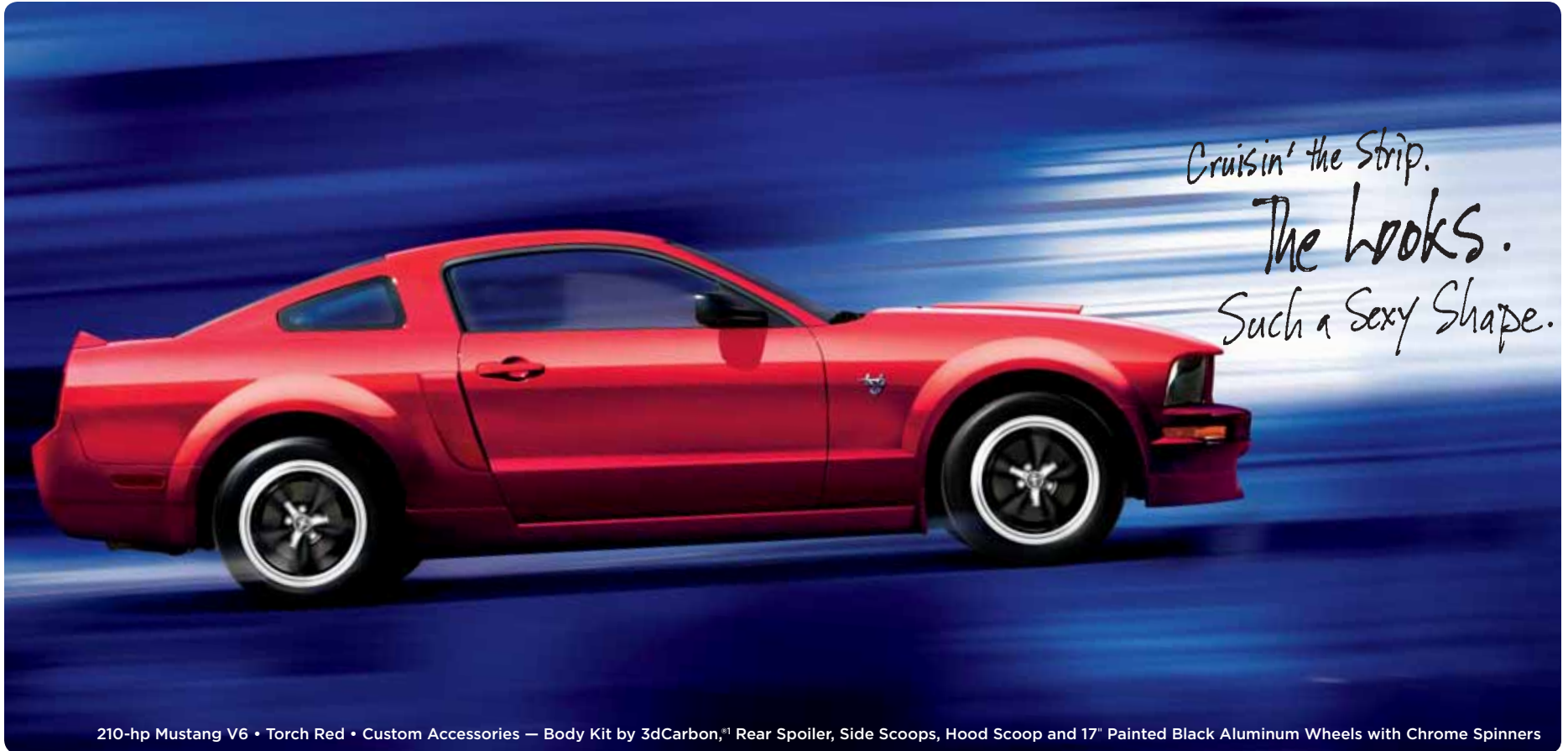
210-hp Mustang V6 • Torch Red • Custom Accessories — Body Kit by 3dCarbon, † Rear Spoiler, Side Scoops, Hood Scoop and 17" Painted Black Aluminum Wheels with Chrome Spinners