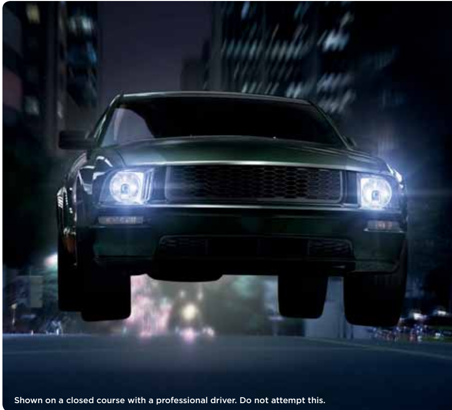
Shown on a closed course with a professional driver. Do not attempt this.