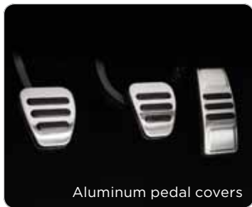
Aluminum pedal covers