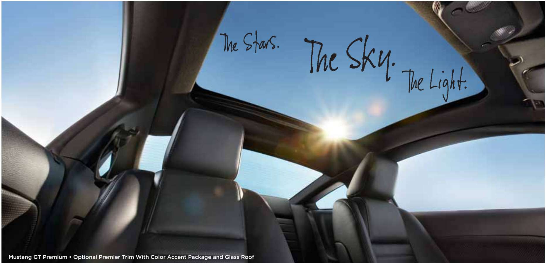
Mustang GT Premium • Optional Premier Trim With Color Accent Package and Glass Roof